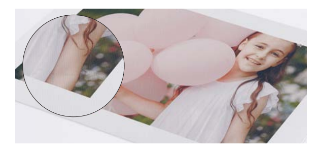
Silk photo paper

High whiteness, slightly pearly surface. Clear print, excellent depth of colour and reduced reflections.